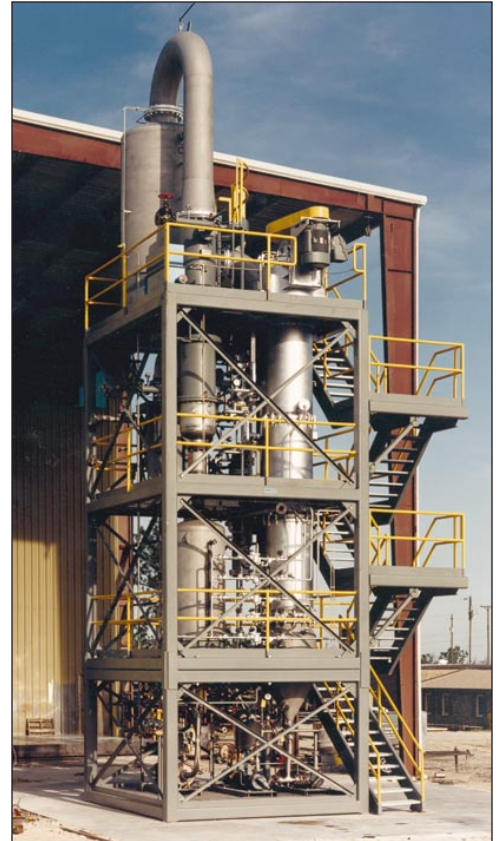
LCI Turba-Film modular system.

Component systems including items such as tanks, pumps and instruments can be furnished, or a complete modular system can be supplied for quick installation.